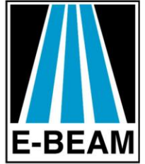
Figure Your Price!